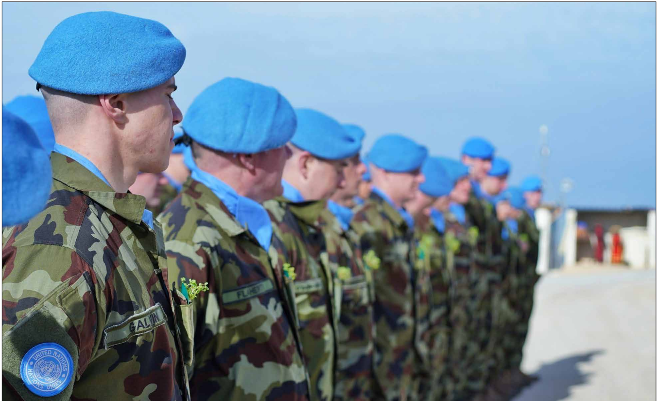
The 'Triple Lock' mechanism governs Ireland's participation in UNIFIL's peacekeeping mission overseas, which requires UN authorisation, Government approval, and Dáil approval before deployment.

Two certainties arise from this factual statement; firstly, Ireland did NOT comply with its obligations as a supposed neutral during World War 2 from 1939-45 as it provided unqualified support, publicly and secretly, for the Allies; and secondly, the text cited from the White Paper is absolutely in keeping with that of Hague, 1907, for true neutrals.