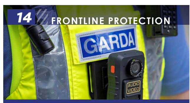
Under new legislation, Gardaí are to get new body cameras, which will be deployed on a pilot basis in mid-2024, before national roll-out in 2025.